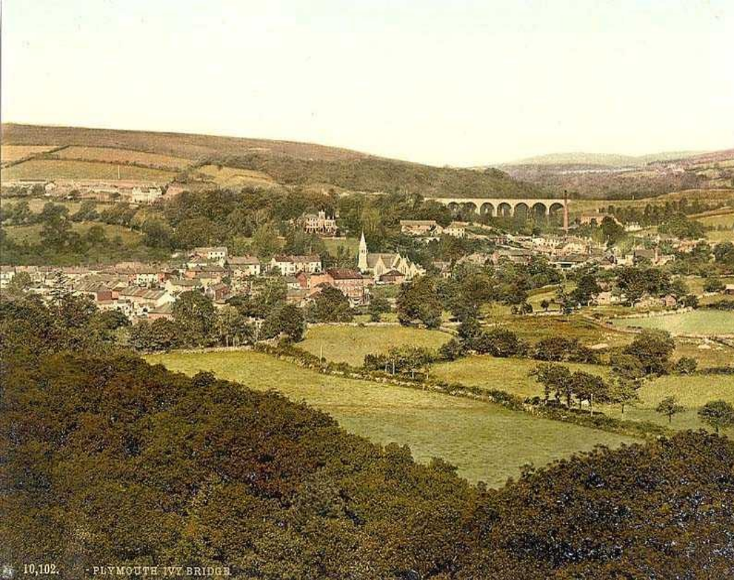
10,102. - PLYMOUTH IVY BRIDGE